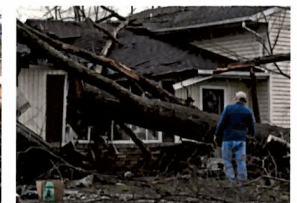
Unlucky tree... Unlucky homeowner.