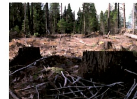
Unlucky trees cleared for a pipeline.

As the city was built around the Sycamore tree it was lucky to avoid the chainsaw, lucky enough to not break under the force of lake Erie's westerlies, lucky enough to attract donors who pay for treatments when it's been sick. When luck isn't enough, call The Tree Doctor.