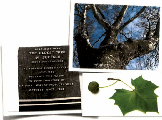
Standing at the base of the Franklin Sycamore, looking up at the three main stems.

How is it this tree has survived for nearly three centuries? To get old trees need a lot of luck and water. With growth in trees, the sky's the limit. They can live (almost) forever. A tree will stop getting taller but growth continues as the tree gets wider, like a bodybuilder putting on extra muscle. Trees often "retrench" and get shorter: the top dies back to support new trunk width.